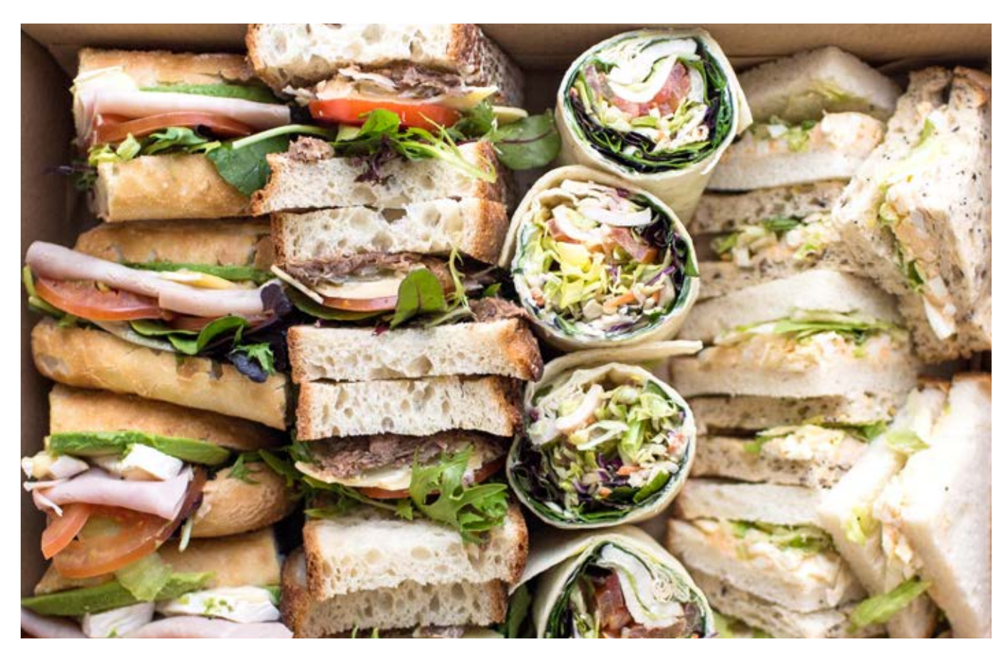
Mixed Sandwich Box